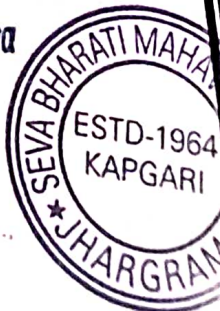
Principal Seva Bharati Mahavidyalaya Kapgari, Jhargram