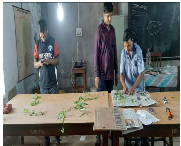
Practical Class (Department of Botany)