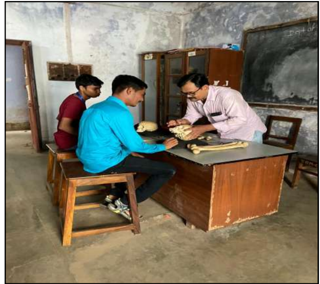
Practical Class (Department of Anthropology)