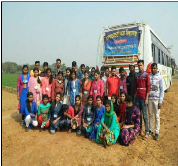
Field Visit by Department of Anthropology, Seva Bharati Mahavidyalaya, Jhargram